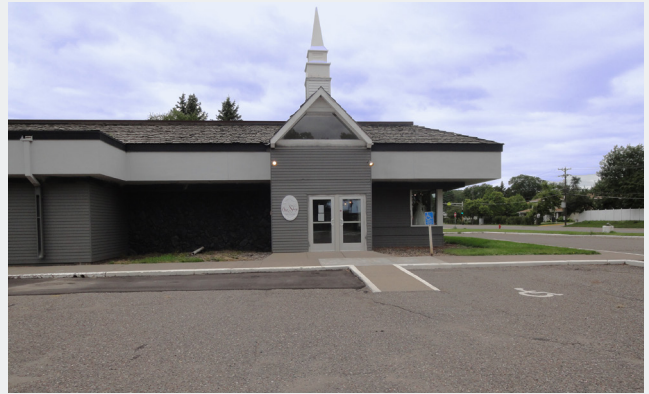
Our Shop Too Bridal- Entrance