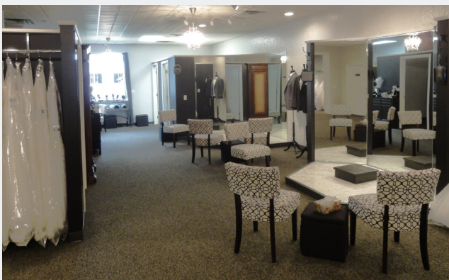
Our Shop Too Bridal- Dressing Area