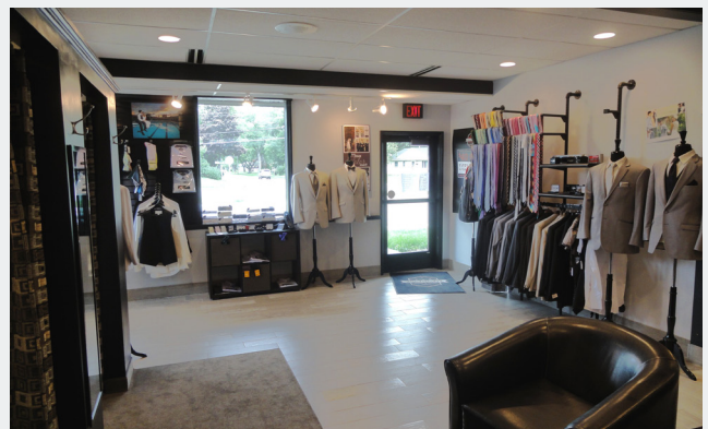
Tip Top Tux Space