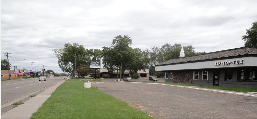
Bass Lake Road Frontage