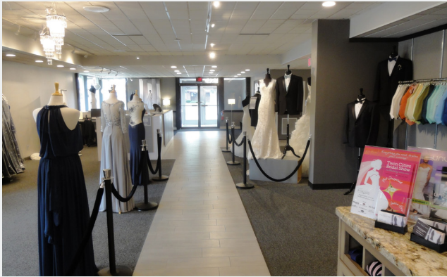
Our Shop Too Bridal- Entry