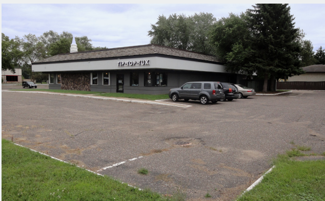
Tip Top Tux - Entrance