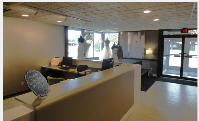
Our Shop Too Bridal- Lobby