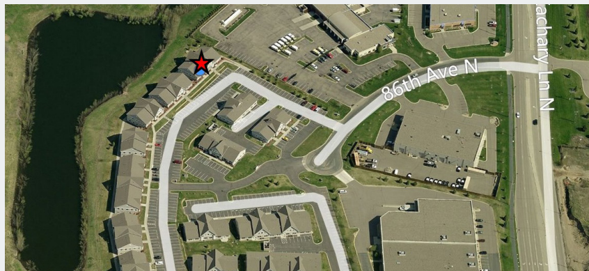
Weaver Lake Office Park