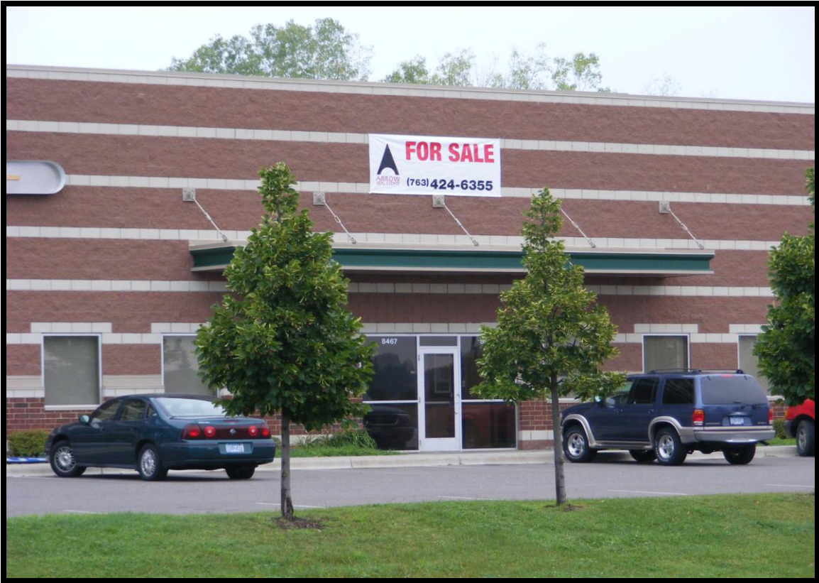
View from back of building