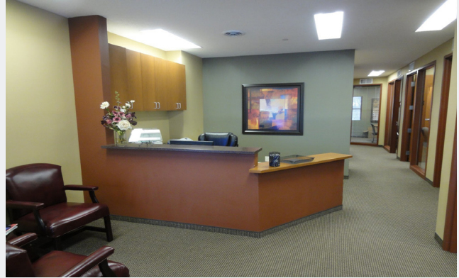
Reception Desk View