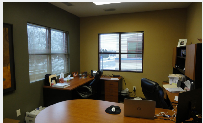
Large Back Office