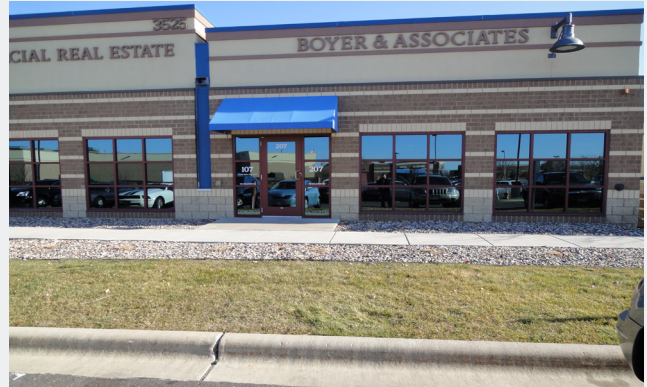
Front Entrance View