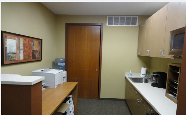
Storage / File Room