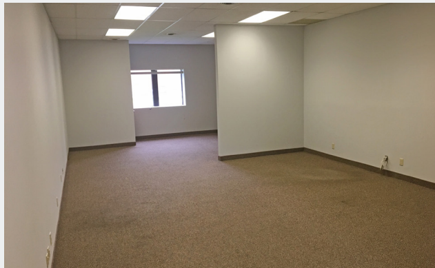
1,143 SF - Office