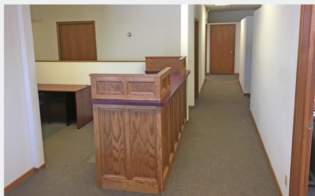
2,300 SF - Reception Area