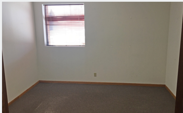
2,300 SF - Office