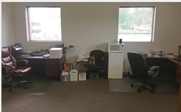
2,300 SF - Office