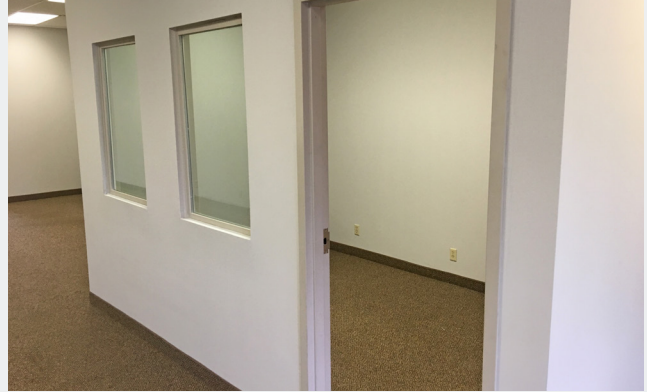
1,143 SF - Office