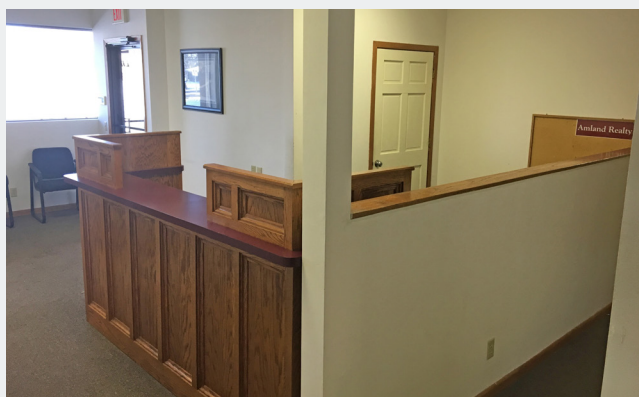
2,300 SF - Reception Area