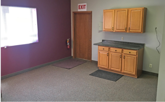
1,143 SF - Break Room