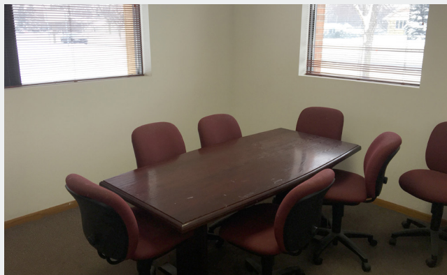
2,300 SF - Conference Room