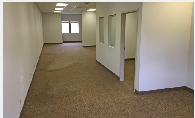
1,143 SF - Open Area