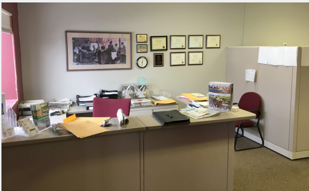
1,143 SF - Reception Area