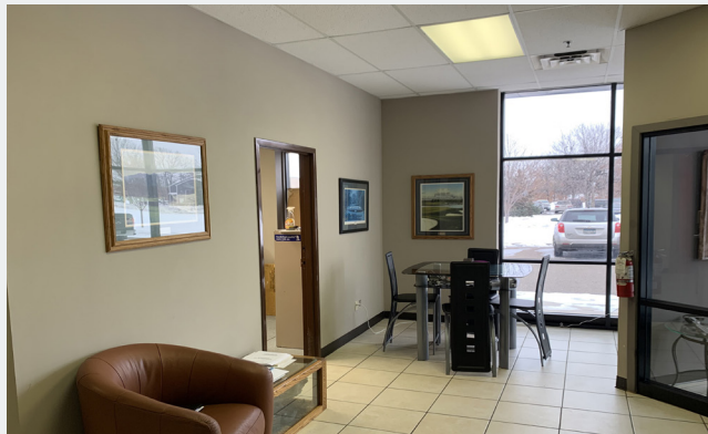
Front Entry View