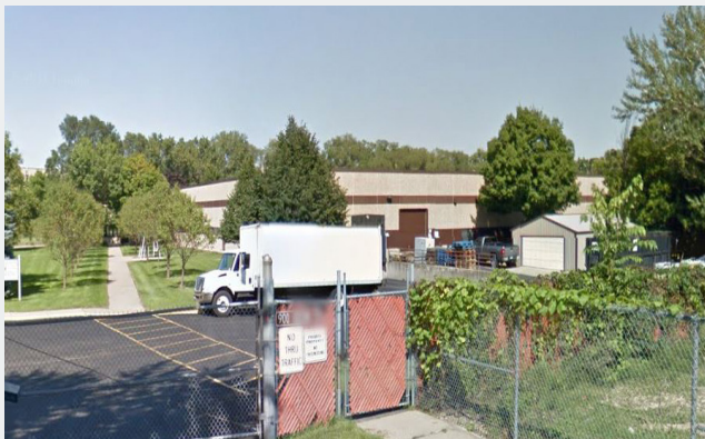
Back of Building