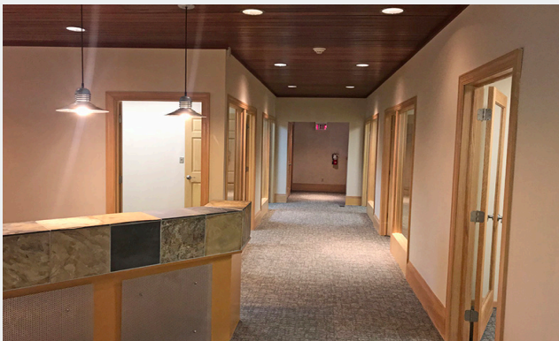
Front Desk Area