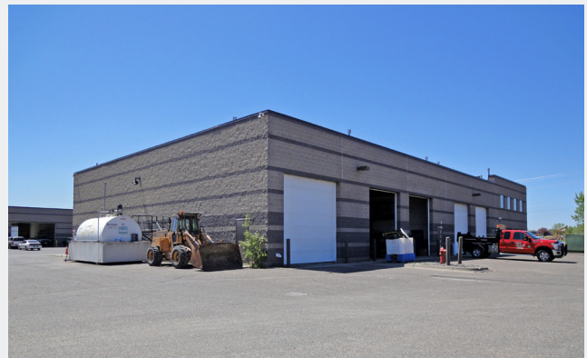
North of Building