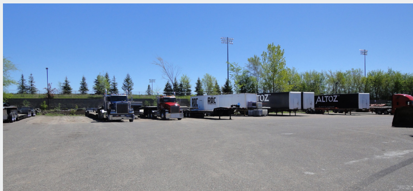
Exterior Parking Area