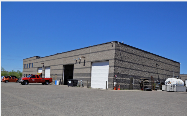
South of Building