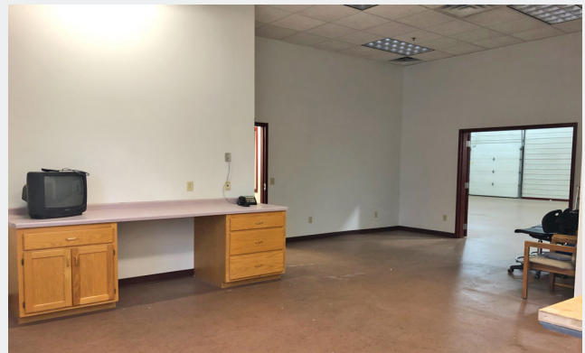
Large Open Office/Front Entrance 2