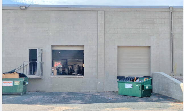
2 Dock Doors/Back Entrance