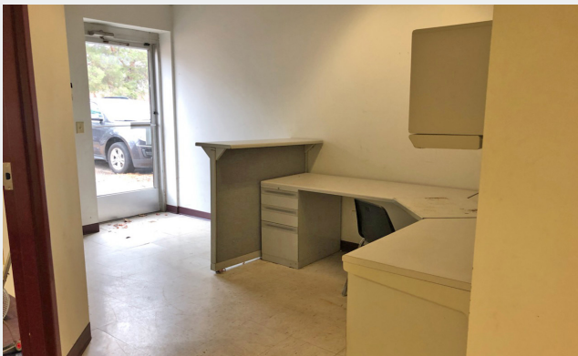
Reception Area/Front Entrance 1