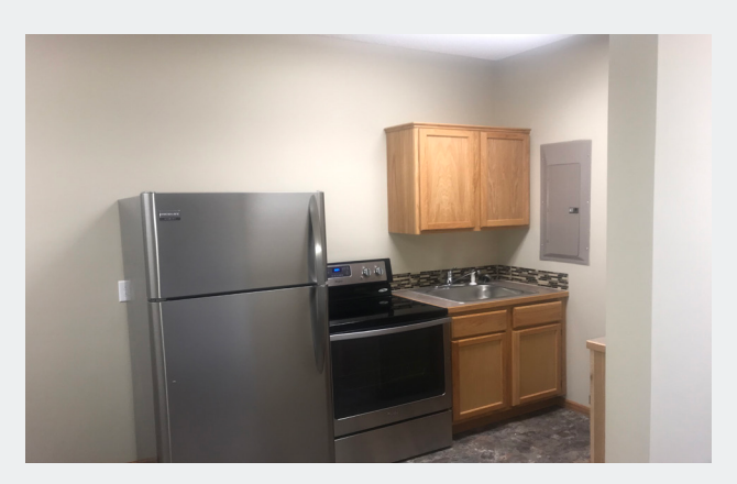
New Kitchen Area